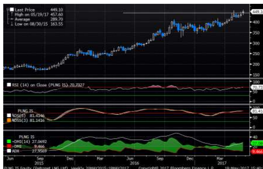
Weekly Chart, RSI, stochastics, ADX I